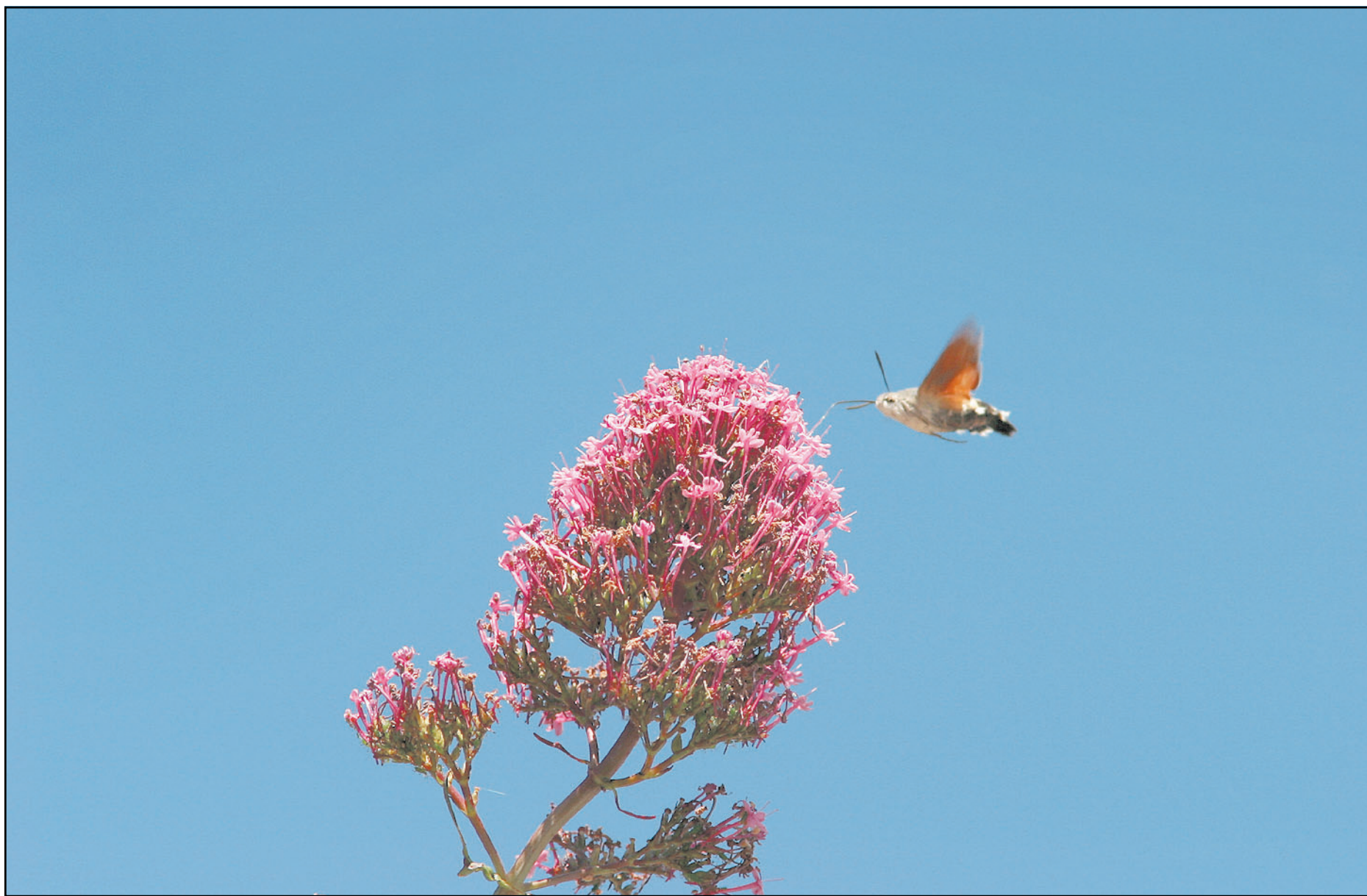
Hummmmm: Humming-bird Hawk Moth taken near Dunderrow, Co Cork. These were reported all over Waterford last year. Some hibernate during the winter but the majority fly in from Mediterranean countries between May and September.

The inside view Mick O'Dwyer writes exclusively on the eve of the Leinster football final Sport